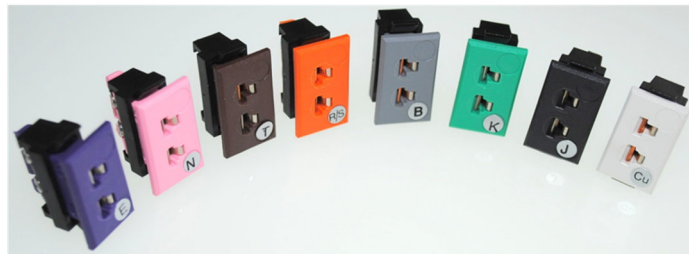
'Panel mounting sockets'