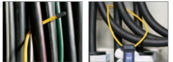
AC FLEXIBLE CURRENT SENSOR CT6280