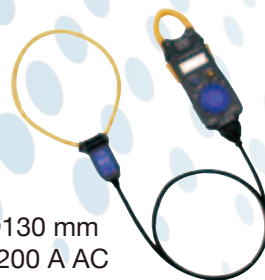
Φ130 mm 4200 A AC