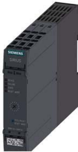
MOTOR STARTER SIRIUS 3RM1 REVERSING STARTER 500 V; 0,4-2,0 A; 110-230 V AC PUSH-IN CONNECTION SYSTEM