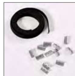
Art. KIT03: elastic bands and metal clips (not included in the Art. KIT TRAY MUB)