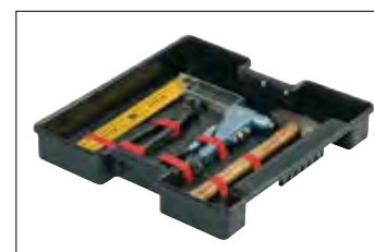
Art. KIT TRAY MUB: 1 tray with divider (the Art. KIT03 is not included)