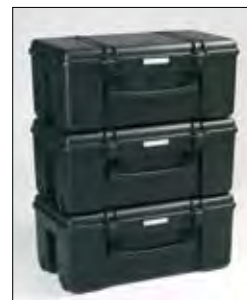
Ability to stack