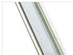
DIN rails DIN EN 60715 TH 15, galvanised steel