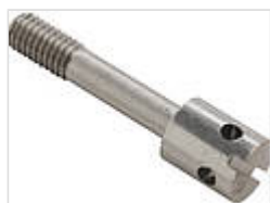
Capstan-headed screws, sealable