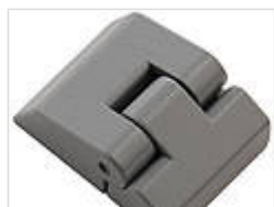
Set of hinges