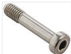
Allen cheese-head screw for lid