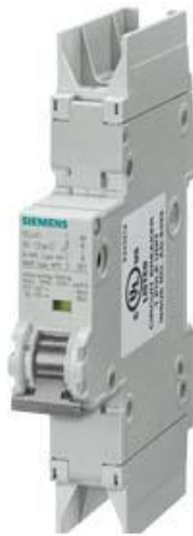
CIRCUIT BREAKER 10KA, 1POLE, D, 5A ACC. TO UL 489 - 277V