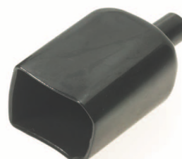
PVC Insulating Cover

The CLIFF MS-3 series Power Input Connectors are produced from heat resistant plastic with solid brass nickel-plated metal parts. Parts for soldering are tin plated. The MS-3 is a composite design incorporating an input, fuseholder and voltage selector. The fuse carrier is available printed with various voltage combinations. Two terminal options are available – Solder Tag and Quick Connect. All products are produced in accordance to IEC320 / EN60-320 and have various safety approvals. The standard colour is Black, however some products are available in other colours, subject to a reasonable order quantity. For voltage selector options, refer to drawing number CL19262. Supplied without fuse fitted.