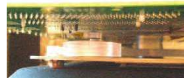
BH-PK1000 Board Holder Pin Kit. Includes: 2 discs, 2 long pins, 2 short pins