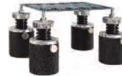
BH-1000 Post-Rail Board Holder. Includes: 4 posts, 2 rails with sliding clips, 4 support pins and flat-head support