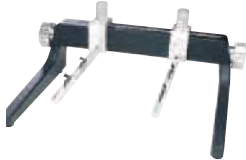
BH-100 Board Holder. Recommended for use with the PCT-100 Pre-heater

Accommodate boards 12" (305mm) x 12" (305mm)