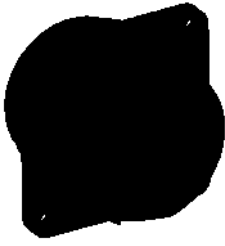
Square Flange Receptacle

(Accepts Type III+, High Current Power and Type II Contacts)