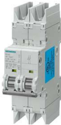
CIRCUIT BREAKER 10KA, 2POLE, D, 32A ACC. TO UL 489 - 480Y/277V