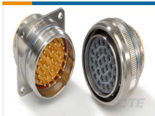
TE Part #ZPF0000000000007174 983-ORS 08-98 PN