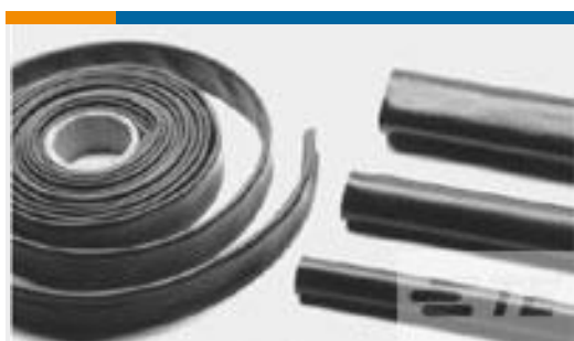
TE Part #CS8624-000 BSTS-15X4FR/NM