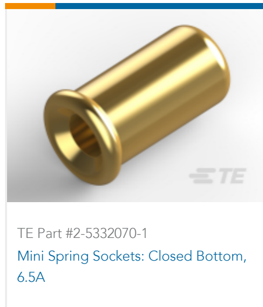
TE Part #2-5332070-1 Mini Spring Sockets: Closed Bottom, 6.5A