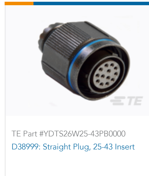
TE Part #YDTS26W25-43PB0000 D38999: Straight Plug, 25-43 Insert