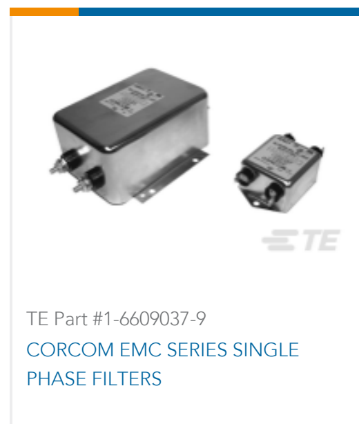
TE Part #1-6609037-9 CORCOM EMC SERIES SINGLE PHASE FILTERS