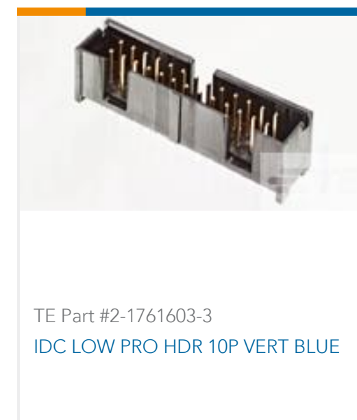
TE Part #2-1761603-3 IDC LOW PRO HDR 10P VERT BLUE