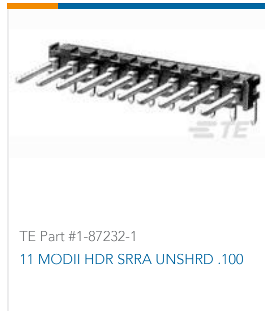
TE Part #1-87232-1 11 MODII HDR SRRA UNSHRD .100