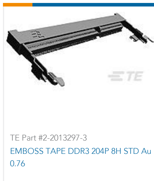
TE Part #2-2013297-3 EMBOSS TAPE DDR3 204P 8H STD Au 0.76