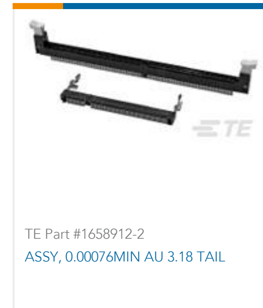
TE Part #1658912-2 ASSY, 0.00076MIN AU 3.18 TAIL