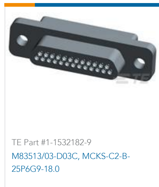
TE Part #1-1532182-9 M83513/03-D03C, MCKS-C2-B- 25P6G9-18.0