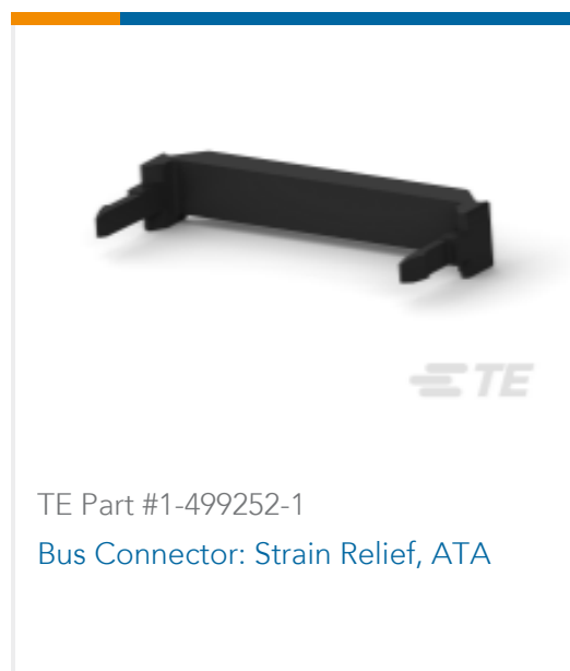
TE Part #1-499252-1 Bus Connector: Strain Relief, ATA