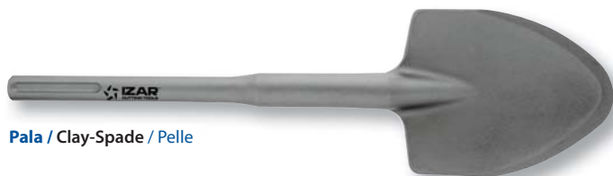
Pala / Clay-Spade / Pelle