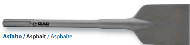
Asfalto / Asphalt / Asphalte