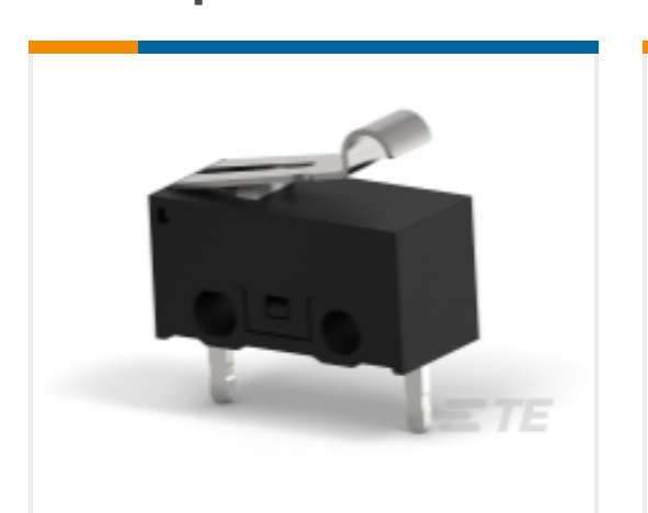
TE Model / Part # 2351449-