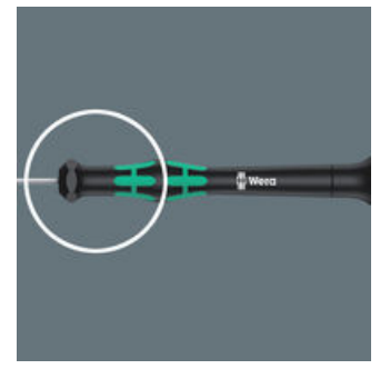
The precision zone directly above the blade gives the user a better feel for the right rotation angle during fine adjustment work.