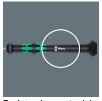
The fast-turning zone just below the rotating cap allows rapid twisting.