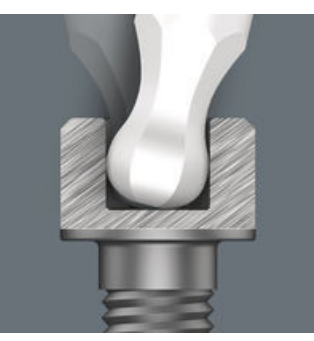
The spherical drive profile means that it is possible to swivel the axis of the tool to that of the screw, and therefore enable angled, "around-the-corner" screwdriving jobs.