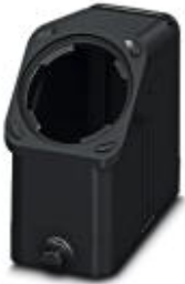
HEAVYCON EVO sleeve housing, plastic, with bayonet flange for EVO screw connection, B16, for single locking latch, height: 76 mm, without EVO screw connection

Please be informed that the data shown in this PDF Document is generated from our Online Catalog. Please find the complete data in the user's documentation. Our General Terms of Use for Downloads are valid ( http://phoenixcontact.com/download )