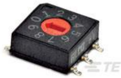
TE Model / Part #1-1825013-7 MRD16RA04=7MM R/A ROT DIP, BCD