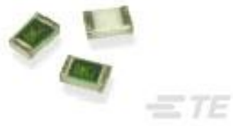
TE Model / Part #1676183-1 RN 0805 13K 0.1% 10PPM CUT LENGTH