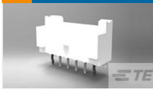
TE Model / Part #1-2132230-6 EP2.5 Shrouded HDR ASSY 16P VE