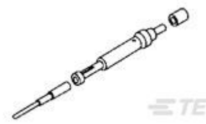
TE Model / Part #226781-2 ARINC SIZE 15 SOCKET