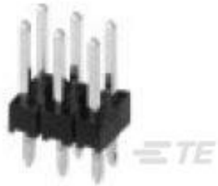
TE Model / Part #104433-3 06 MODII HDR DRST B/A W/HD