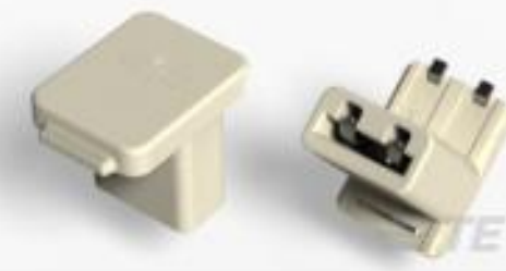
TE Model / Part #2213189-4 Assembly, IPI Connector 26-24GA w cap