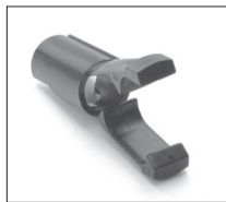
Standard Jaws cable clamp (Black), Cable O.D 3mm to 6mm (0.118" to 0.236")