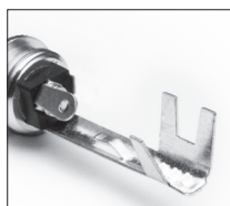
M-Series II, Cable O.D 3mm to 8mm (0.118" to 0.315")