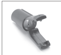
Large Jaws cable clamp (Purple), Cable O.D 6mm to 7.5mm (0.236" to 0.295")

*Note: Applicable to T-Series straight cable connectors only. Refer to page 95 for right angle connector Jaws cable clamp specifications.