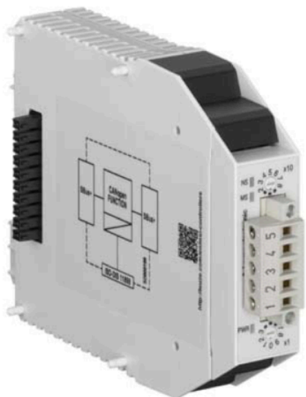
Part no.: 50132994 MSI-FB-CANOPEN Fieldbus gateway