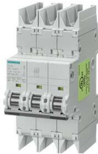
CIRCUIT BREAKER 10KA, 3POLE, D, 13A ACC. TO UL 489 - 480Y/277V