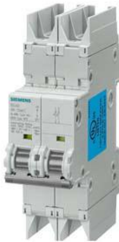
CIRCUIT BREAKER 10KA, 2POLE, D, 0.3A ACC. TO UL 489 - 480Y/277V