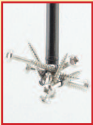
No. 70390 24" (610 mm)