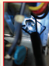
No. 70399 36" (914 mm)