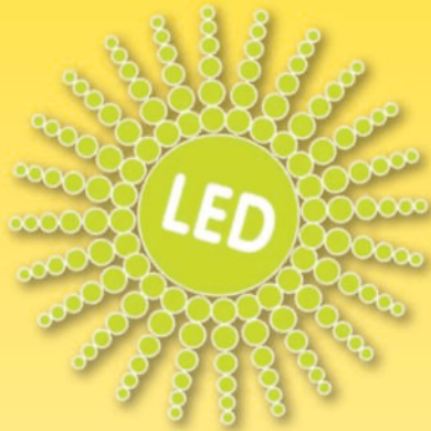
No. 70393 12" (305 mm)