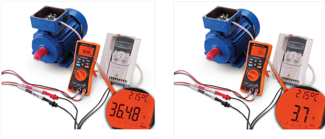
Figure 2. U1272A helps you identify the presence of stray voltage on a disconnected wire running parallel with the wire powering up the VFD to an industrial motor. The image on the right shows the U1272A in low impedance mode.

The peak detect function allows you to capture the engine or motor startup transient as fast as 250 \mu s.