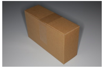
Old cardboard box

New cardboard box with compartments, new outer dimensions 385x285x55mm.