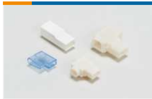
Crimp Terminal Housings(38)