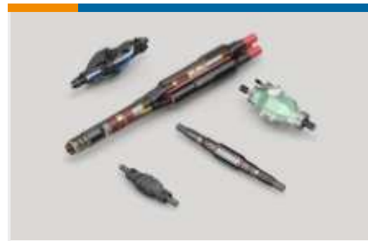
Joints & Splices(1)