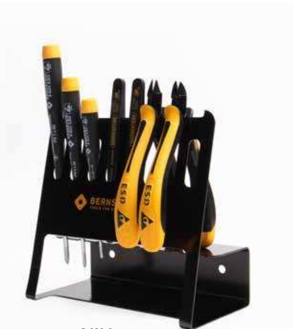
5-090-0 without tools