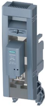
Fuse carrier with EFM15, for size NH2 1-pole, DC 120 - 440V accessories for 3NP1 fuse switch disconnectors