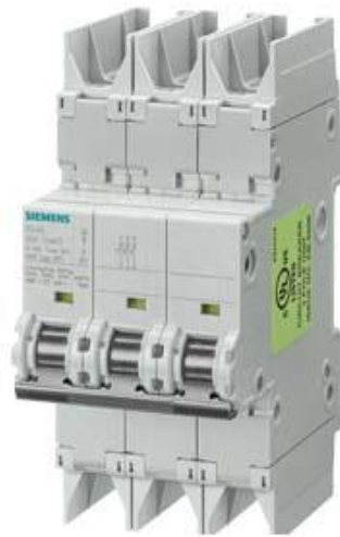
CIRCUIT BREAKER 10KA, 3POLE, C, 15A ACC. TO UL 489 - 480Y/277V