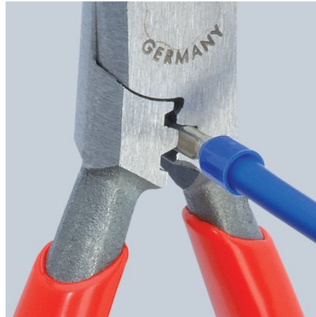
Crimping 0.5 to 2.5 mm 2