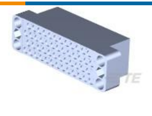
TE Part #200277-2 FEMALE BLOCK 50 PL.