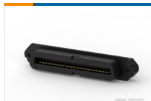
TE Part #5557984-2 D-Sub Receptacle Assembly: Vertical, Action Pin, 2.16mm