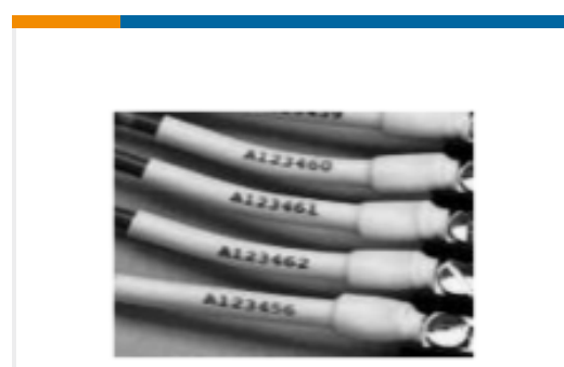
TE Part #EE1122-000 CPGI-RNF-100-1/2-9-3IN