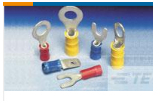
TE Part #322315 TERMINAL,PI FLAG R 12-10 10