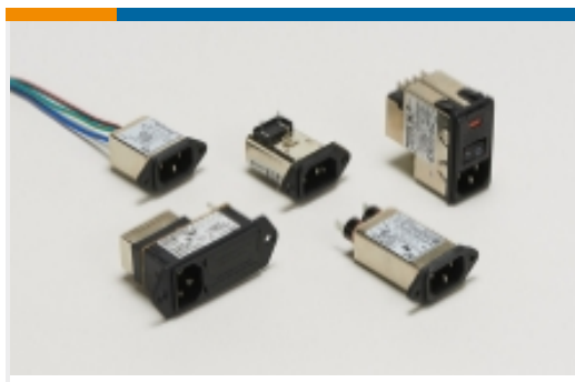
Multi-Function Inlet Filters(13)