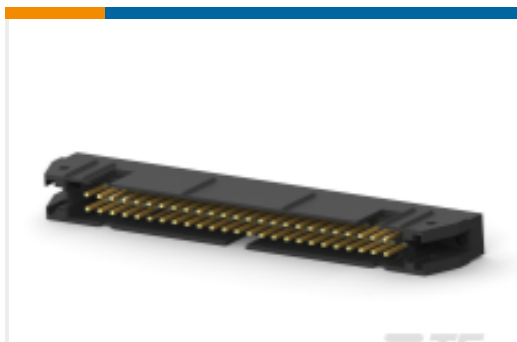
TE Part #1-5111105-2 AMP-LATCH UNIVERSAL HEADERS