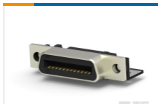
TE Part #1-6339447-0 D-Sub Shielded Receptacle Assembly: Right Angle, 2.16mm