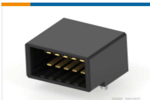
TE Part #1-179188-2 DYNAMIC 3100 HDR ASSY