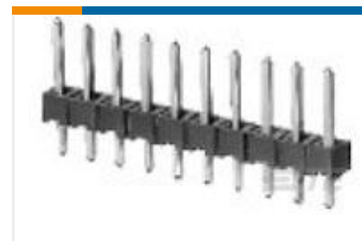
TE Part #146281-3 03 MODII HDR SRST B/A .100CL