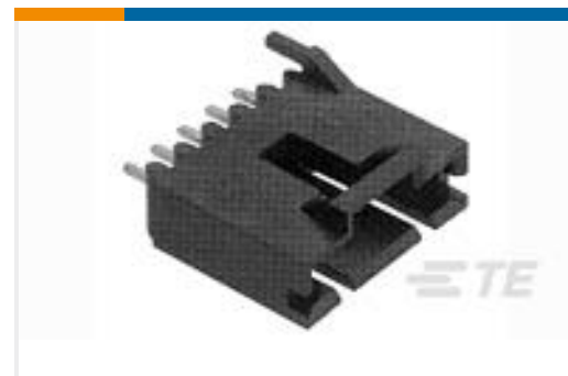
TE Part #5-104809-9 10 MTE HDR SRST LATCH W/HLDWN