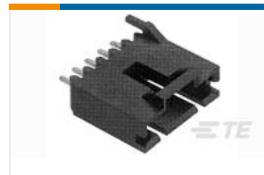
TE Part #6-104809-0 11 MTE HDR SRST LATCH W/HLDWN