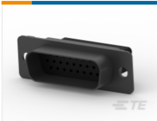
TE Part #1658676-1 D-Sub Crimp: Plug, Signal, 26 Posn, Pin Size 22, Shell Size 2