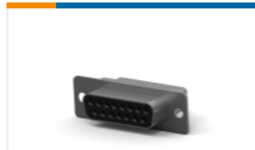
TE Part #1658656-1 D-Sub Crimp Recept Signal 15 Posn, Socket Size 20, Shell Size 2