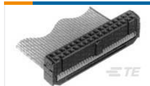
TE Part #1658528-2 636-1041LF FEM SOCKET, LEAD FREE