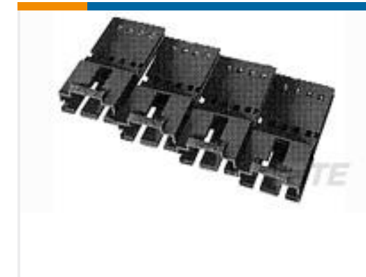
TE Part #103653-4 05 MTE SHRD PIN HSG SR LATCH