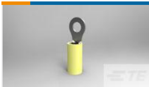
TE Part #134019-1 PIDG R 12 IR 5MM