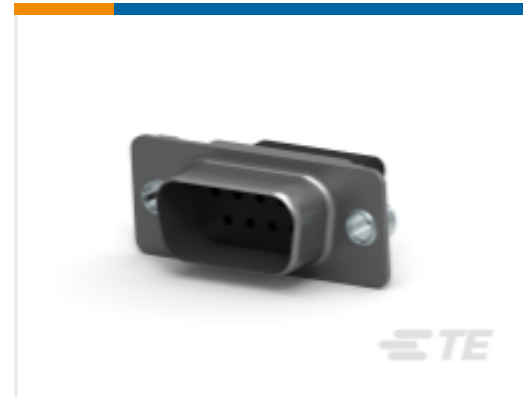
TE Part #1658655-1 D-Sub Crimp: Plug, Signal, 9 Posn, Pin Size 20, Shell Size 1