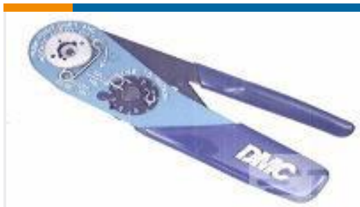
TE Part # 601966-1 CRIMPING TOOL M22520/2-01