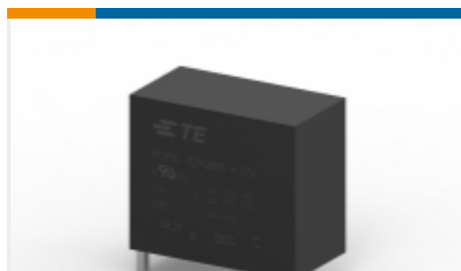
TE Part #1721768-2 PCFN SOLAR RELAY