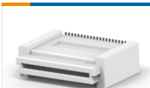
TE Part #5179010-1 Free Height Receptacle Conn: Board-Board, Vertical, 40, 0.8mm