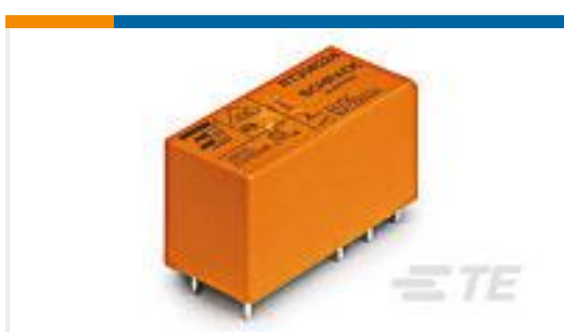
TE Part #5-1393238-7 RTD14F03