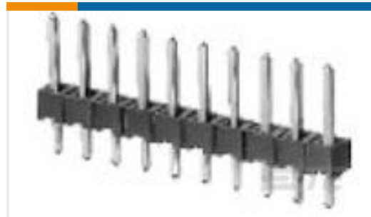
TE Part #5-146293-8 08 MODII HDR SRST B/A 100 W/HD