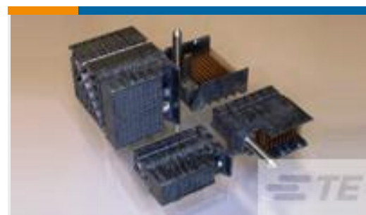
TE Part #2143016-3 IMP100S,H,RA2P10C,LG,OEW39,5.5