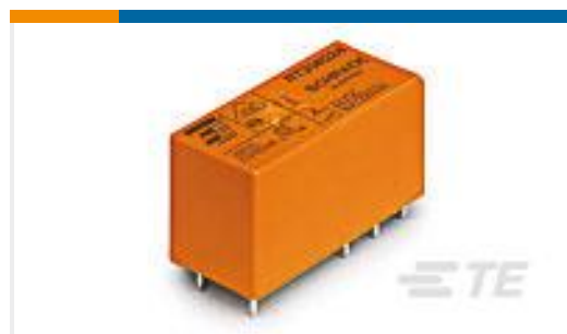
TE Part #3-1393240-6 RT33L048