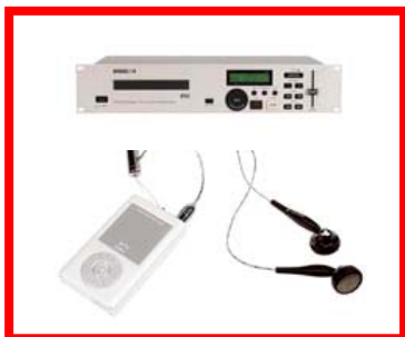
CD player MP3 player...