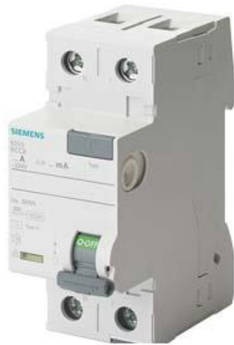
RES.CUR.OP.CIRCUIT BREAKER TYPE A 25A 1+N- POLE 300MA 230V 2MW N-LEFT