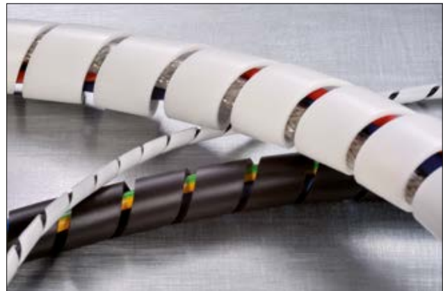
Spiral binding SBPEFR is available in a wide range of diameters and in colours black and white.