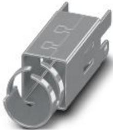
Accessories, number of positions: 2, pitch: 2.54 mm

Please be informed that the data shown in this PDF Document is generated from our Online Catalog. Please find the complete data in the user's documentation. Our General Terms of Use for Downloads are valid ( http://phoenixcontact.com/download )