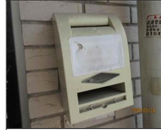
External photo(s) of the production unit(s) Suggestion box.JPG