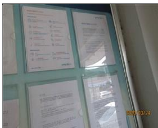
External photo(s) of the production unit(s) COC posted.JPG