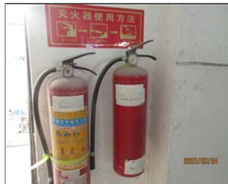
External photo(s) of the production unit(s) Fire extinguishers.JPG