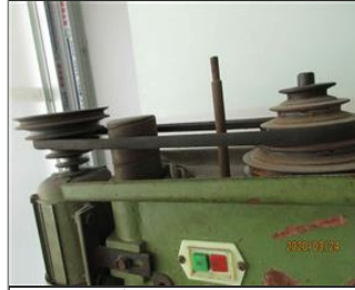
External photo(s) of the production unit(s) NC 7.17 Missing pulley guard for transmission belt.JPG