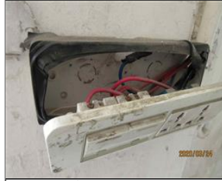
External photo(s) of the production unit(s) NC 7.13 Missing insulation device for electric switch.JPG