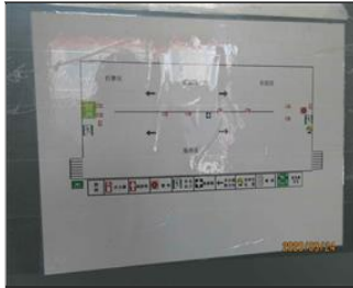
External photo(s) of the production unit(s) Evacuation plan.JPG