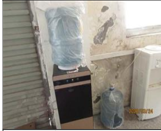
External photo(s) of the production unit(s) Drinking water.JPG