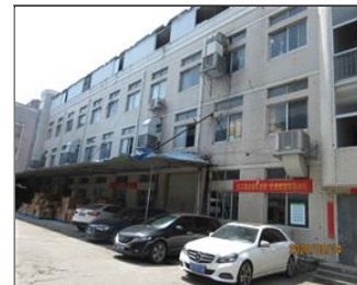
External photo(s) of the production unit(s) Production building.JPG