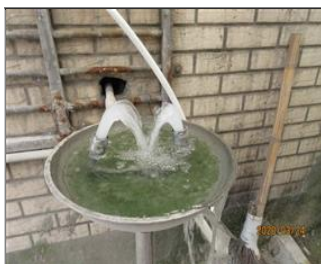
External photo(s) of the production unit(s) Eye washing facility.JPG