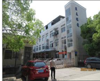
External photo(s) of the production unit(s) Factory entrance.JPG