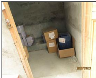
External photo(s) of the production unit(s) Chemical warehouse.JPG