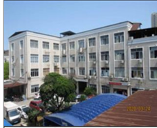
External photo(s) of the production unit(s) Office and canteen and dormitory building.JPG