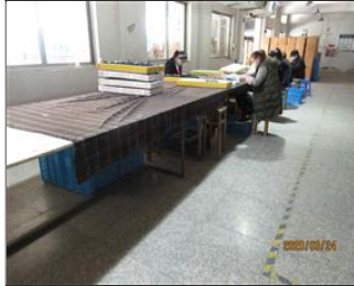
External photo(s) of the production unit(s) Assembling area.JPG