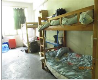
External photo(s) of the production unit(s) Dormitory interior.JPG