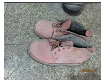
External photo(s) of the production unit(s) Safety shoes.JPG