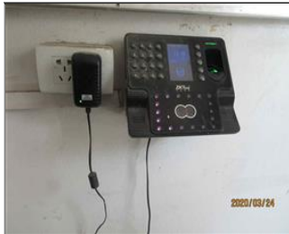
External photo(s) of the production unit(s) Attendance recording machine.JPG