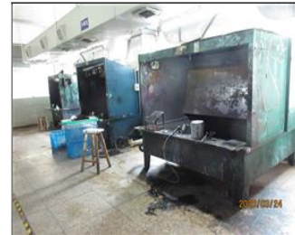
External photo(s) of the production unit(s) Paint spraying area.JPG