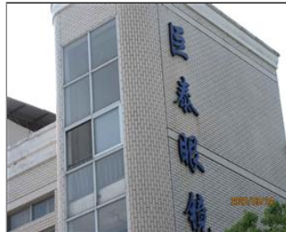
External photo(s) of the production unit(s) Factory name.JPG