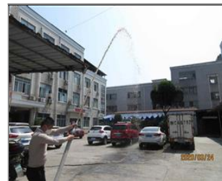
External photo(s) of the production unit(s) Testing of fire hydrant.JPG