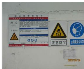
External photo(s) of the production unit(s) Occupation hazard warning.JPG