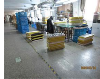
External photo(s) of the production unit(s) Packing area.JPG