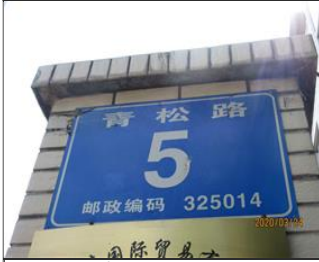
External photo(s) of the production unit(s) Factory address.JPG