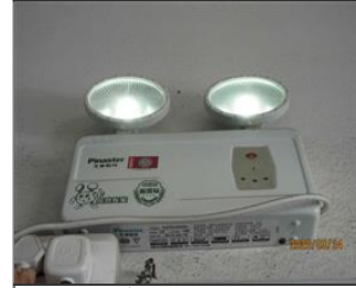
External photo(s) of the production unit(s) Testing of emergency light.JPG