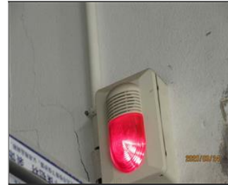
External photo(s) of the production unit(s) Testing of fire alarm.JPG