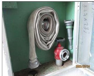
External photo(s) of the production unit(s) Fire hydrant box.JPG