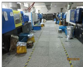
External photo(s) of the production unit(s) Injection area.JPG