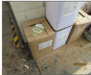
External photo(s) of the production unit(s) NC 7.7 No secondary container for hazardous chemicals.JPG