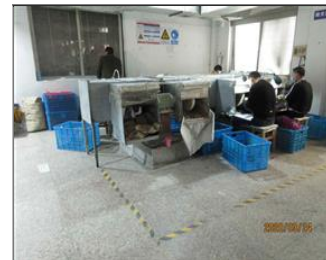
External photo(s) of the production unit(s) Polishing area.JPG