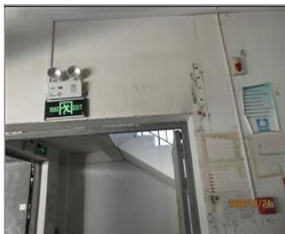
External photo(s) of the production unit(s) Exit sign and emergency light and fire alarm.JPG