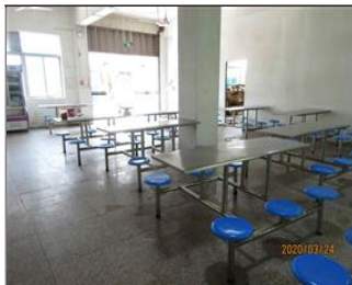
External photo(s) of the production unit(s) Canteen interior.JPG