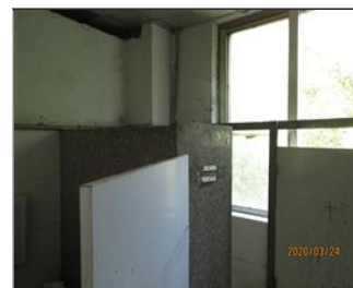
External photo(s) of the production unit(s) Toilet.JPG