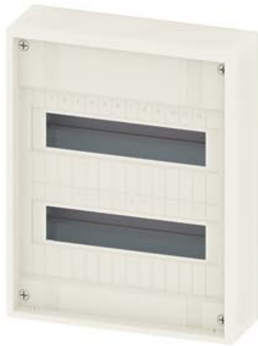
SIMBOX XL - WALL MOUNTED 2 ROWS - 2 X 12 MW (14 MW) SAFETY CLASS II WITHOUT DOOR