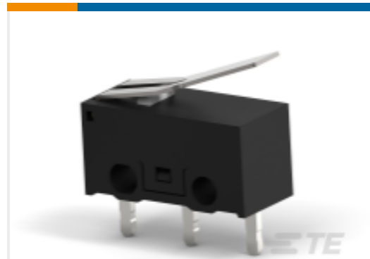
TE Model / Part # 2351447-4 UMINSA SW BLV0.88N 3A /1.5A AC SC PCB