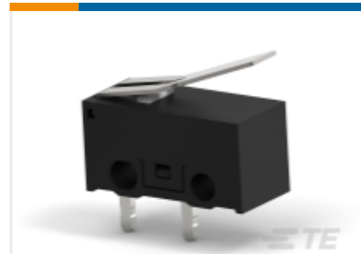
TE Model / Part # 2351447-6 UMINSA SW BLV0.88N 3A /1.5A AC NO PCB