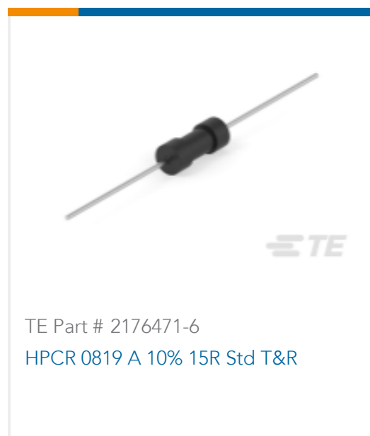
TE Part # 2176471-6 HPCR 0819 A 10% 15R Std T&R