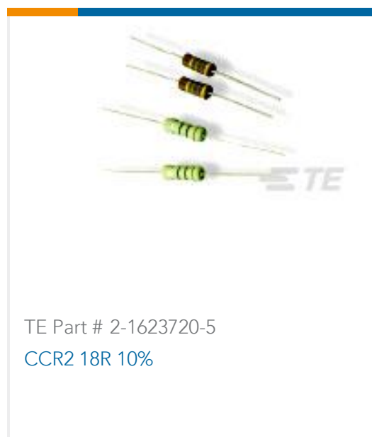
TE Part # 2-1623720-5 CCR2 18R 10%