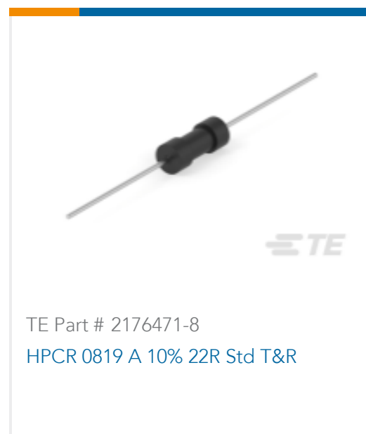
TE Part # 2176471-8 HPCR 0819 A 10% 22R Std T&R