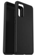
Black 77-81299 840104239865