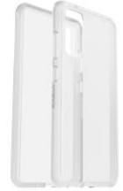
Clear 77-81298 840104239858

React Series is an ultra-slim, resilient OtterBox case that protects your phone from drops and scrapes. Its solid one-piece form is precision designed for your phone and its soft touch edges provide great grip. The case installs easily onto your phone and it slides in and out of pockets seamlessly. OtterBox is known for its stellar customer support and industry-leading warranty. Wrap your phone in the trusted protection of React Series.