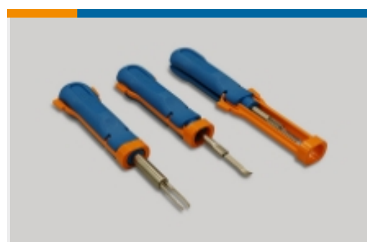
Insertion & Extraction Tools(42)