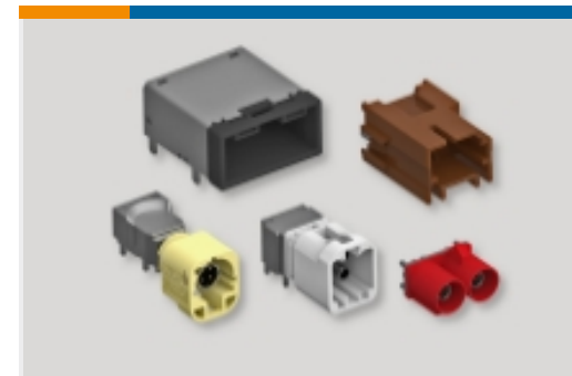
Data Connectivity Headers(1)