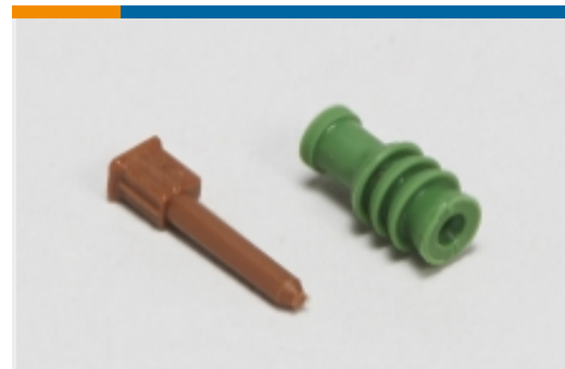
Automotive Seals & Cavity Plugs(26)