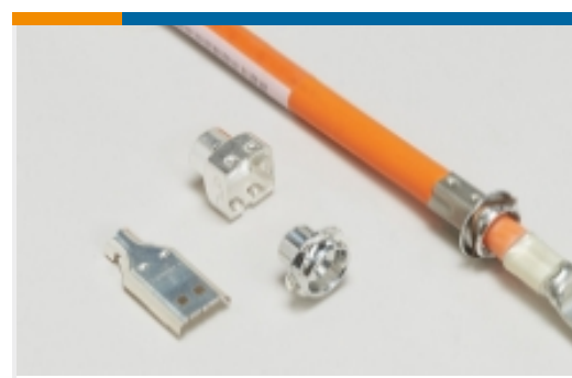
Automotive Connector EMC Shielding (2)