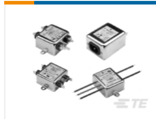
TE Part #1-6609028-2 CORCOM K SERIES SINGLE PHASE FILTERS