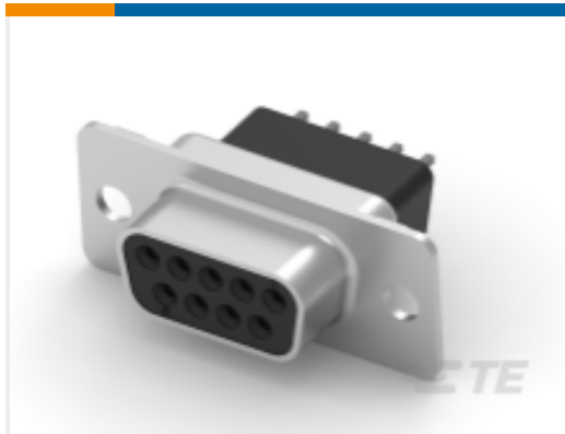
TE Part #1-5747150-3 D-Sub Receptacle Assembly: Vertical, Shell Size 1, 2.74mm