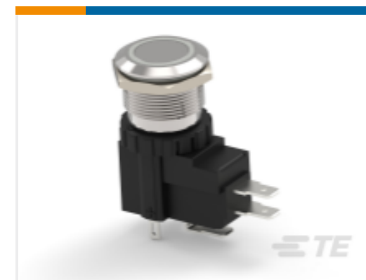
TE Part #1-2364570-5 AVH19 FLT SS MT RNG GRN 24V16A