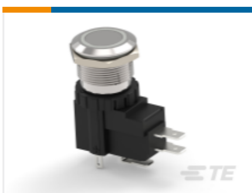
TE Part #1-2364570-9 AVH19 FLT SS MT RNG BLU 24V16A