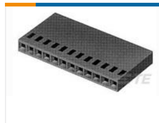
TE Part #1-87499-1 06 MODIV HSG SR MRKD .100CL