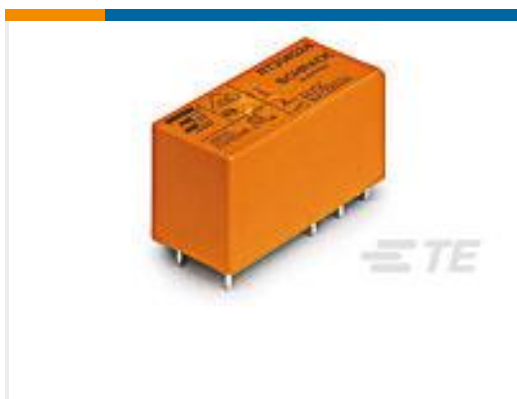
TE Part #1-1419108-7 RT424024F