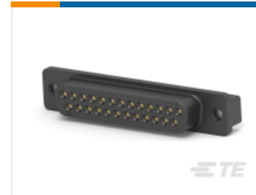
TE Part #1-5745967-4 D-Sub Receptacle Assembly: Vertical, Shell Size 3, 2.77mm