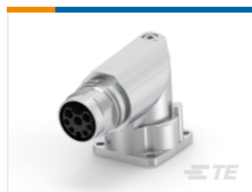
TE Part #BGC880N0000052A000 917 RECEPTACLE, ANGLED, ROTATABLE