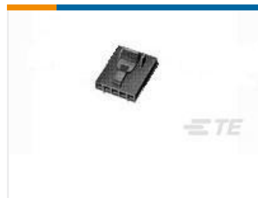
TE Part #104257-2 03 MTE RCPT HSG SR LATCH .100