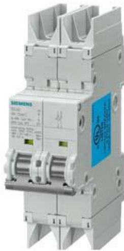
CIRCUIT BREAKER 10KA, 2POLE, D, 20A ACC. TO UL 489 - 480Y/277V