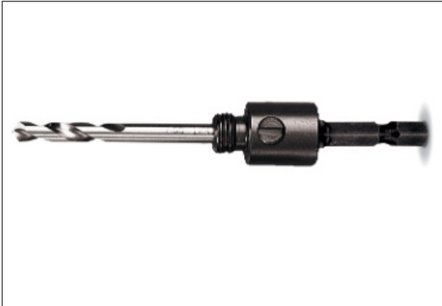
For the range of Arbors to suit. See pg 53