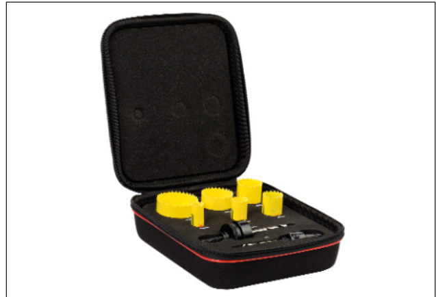
Fast Cut Hole Saw Kits also available. See pg 52