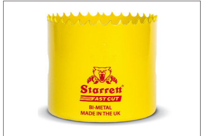
Fast Cut Hole Saw.