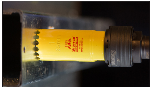
Fast Cut Hole Saw application.