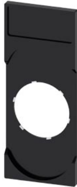
Label holder, 22mm, for twin pushbutton, flat, black, for labeling plate 12.5 mm x 27 mm