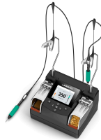
NANE 2-Tool Nano Soldering

Copyright © 2024 JBC Soldering S.L. | Legal Notice | Privacy Policy | Terms and Conditions | Cookie policy | Internal Communication | RSS Feed | JBC Store | Contact Us