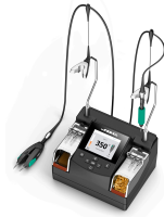
NASE 2-Tool Nano Rework