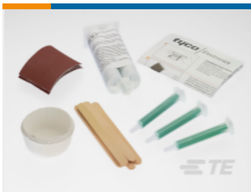
TE Part # 657863-000 S1125-KIT-8