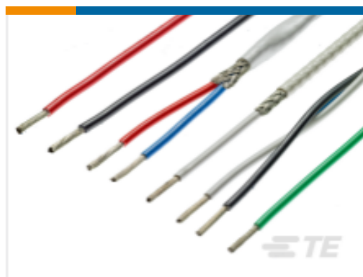
TE Part #386587-000 44A1131-24-4/5/6-9