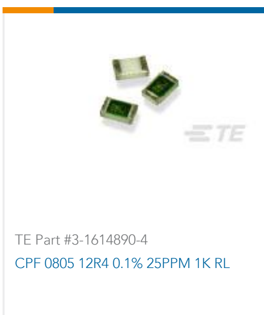
TE Part #3-1614890-4 CPF 0805 12R4 0.1% 25PPM 1K RL